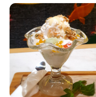
KEM XOI DƯA - PANDAN STICKY RICE WITH ROASTED COCONUT $12.50