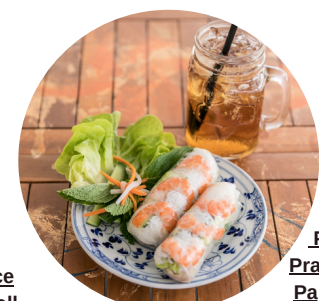
Pork & Prawn Rice Paper Roll