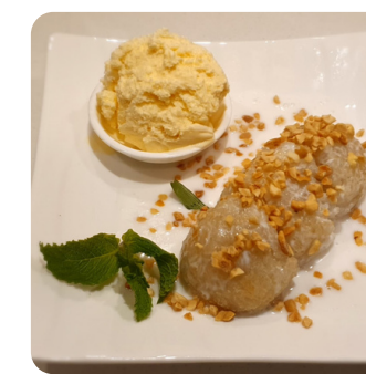
CHUOI NUONG - GRILLED BANANA WRAPPED IN STICKY RICE WITH ICE CREAM $12.50