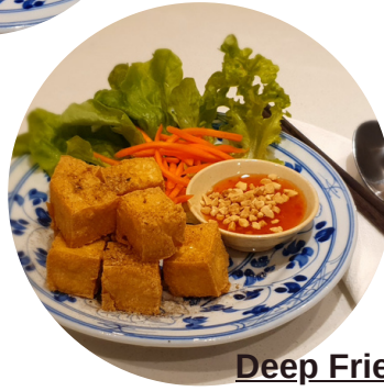
Deep Fried Tofu (VG)