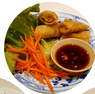
Vegetable Spring Roll (VG)