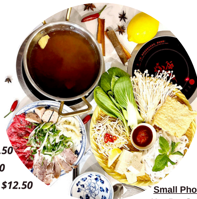
Small Pho Hot Pot Set