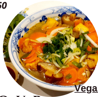
Vegan Pho (VG)