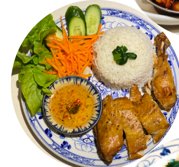
Rice with Crispy Skin Chicken