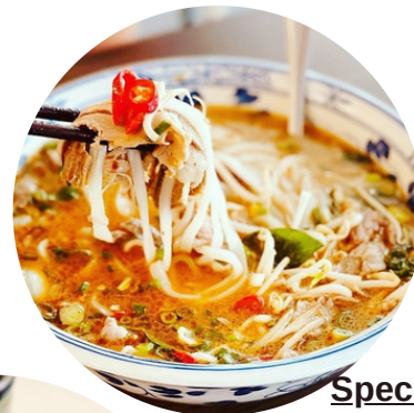
Special Beef Pho