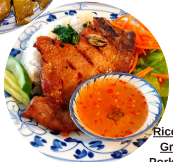
Rice with Grilled Pork Chop