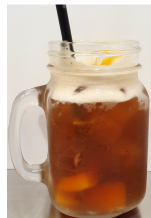
Peach Ice Tea