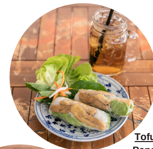
Tofu Rice Paper Roll (VG)