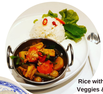
Rice with Veggies & Tofu Stew (VG)