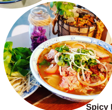
Spicy Beef Noodle Soup