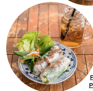
Grilled Pork Rice Paper Roll