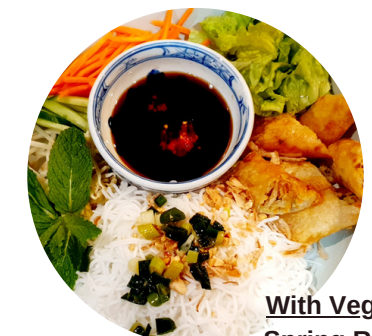
With Vegetarian Spring Roll (VG)