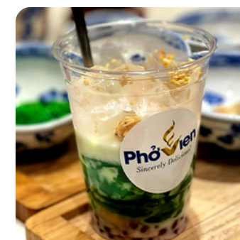
CHÈ BA MÀU - VIETNAMESE THREE COLOR DESSERT $9.50