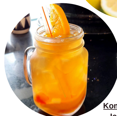
Kombucha Ice Tea